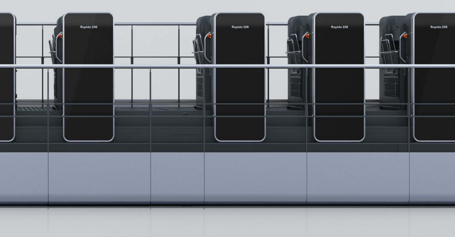
Plate changeover: Take your pick!